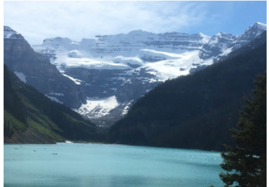
Lake Louise in Banff National Park, Alberta, Canada.