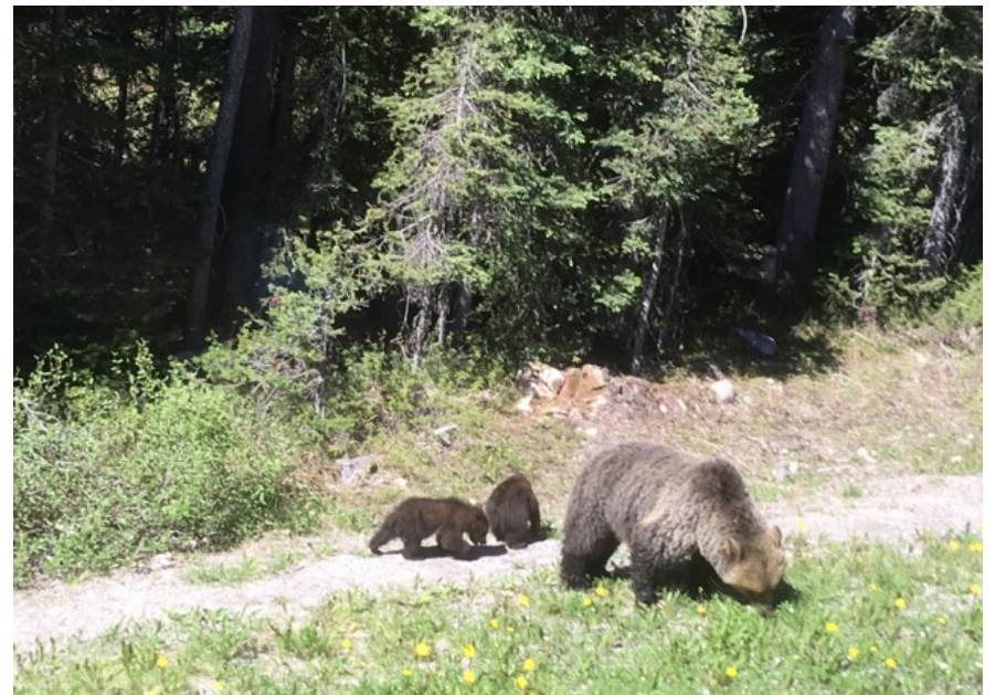
Mother Grizzly Bear with two cubs eating dandelions at the roadside.